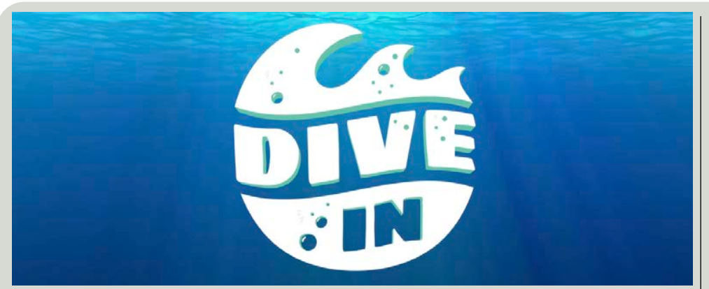
Join us this summer as we "dive in" to follow Jesus! It's going to be a splash!