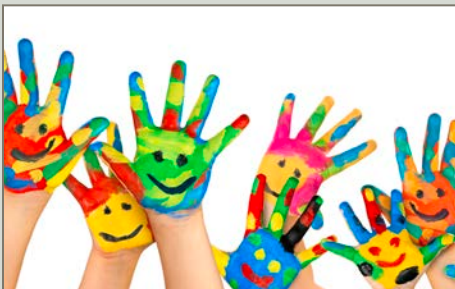
SUNDAY SCHOOL TOPICS FOR KIDS PAGE 2