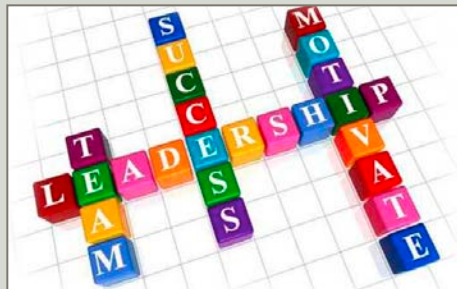
YOUTH LEADERSHIP RETREAT SET PAGE 3