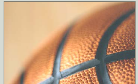
HOOPS4HIM GAME SCHEDULE BEGINS PAGE 4