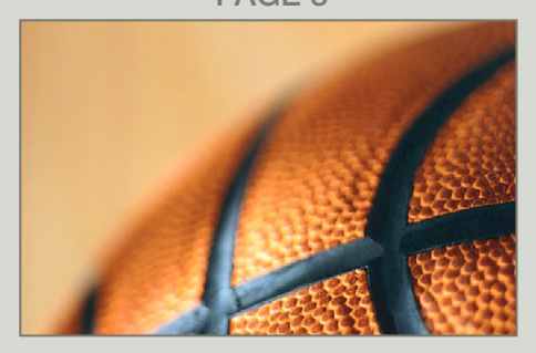
HOOPS4HIM GAME SCHEDULE CONTINUES