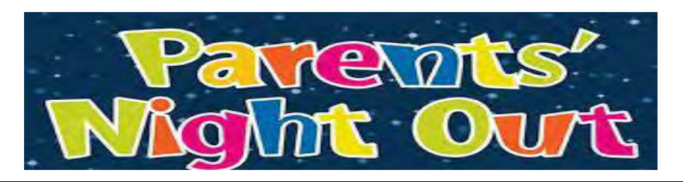
"See what great love the Father has lavished on us, that we should be called children of God! And that is what we are!" 1 John 3:1

Calling all kids! Let's give your parents a night out! While they are away, we will play! Come join us on Friday, June 9th, as we celebrate the last day of school! Bring a bag dinner and we will provide the drinks, desserts, and fun! More details will be coming your way soon!